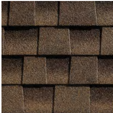
Beautiful finished look It's the same Timberline® Shingle you know and love, now even better