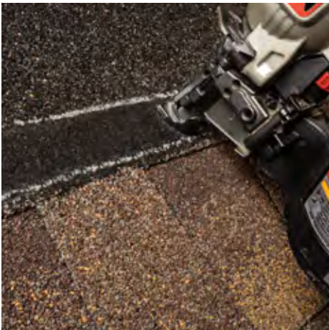
LayerLock™ Technology Powers the industry's widest nailing zone