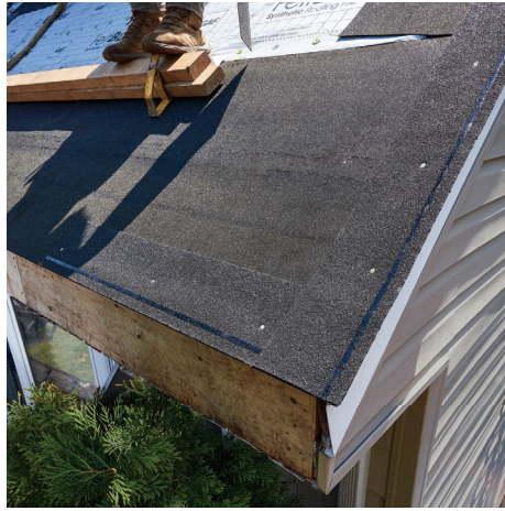
Installs at the eaves and rakes to help prevent shingle blow-off