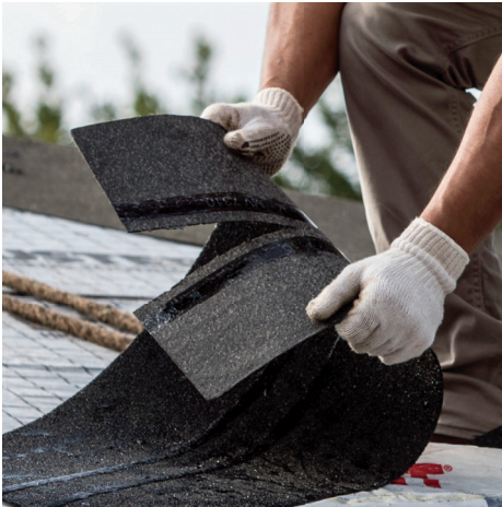
Tears in half easily along perforation for easy installation